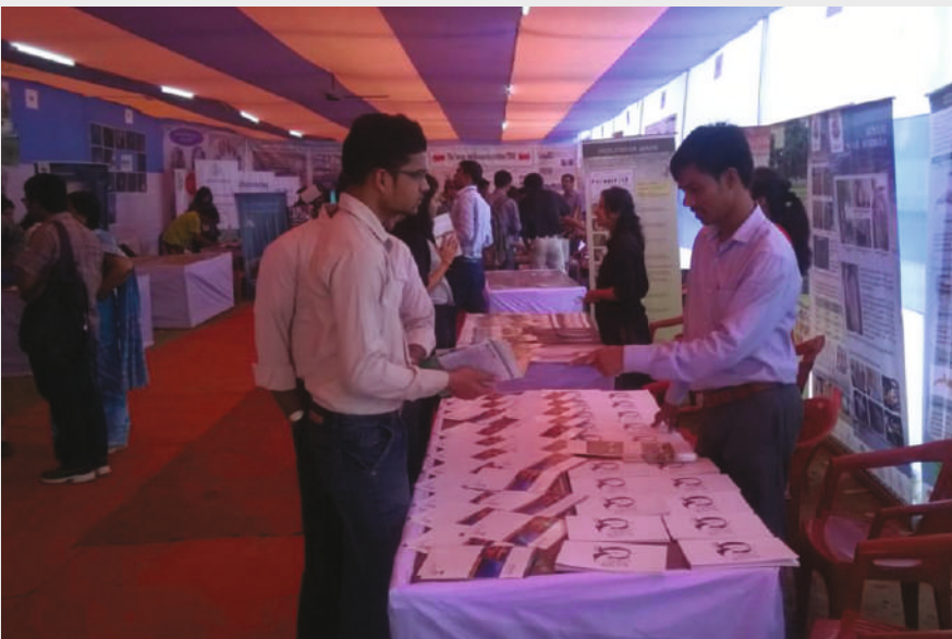
ASBB Staff interacting with visitors at the Stall