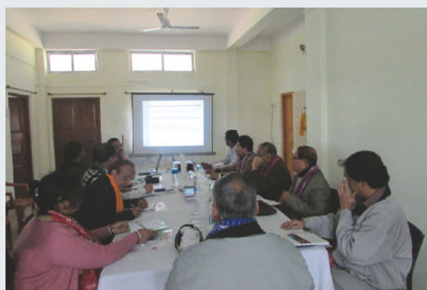
Member Secretary presenting key issues during the meeting