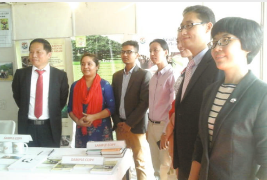
Vibrant NE, 19 th -20 th February 2016 (Chinese delegates at ASBB Stall)