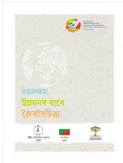
Booklet- Biodiversity for Sustainable Development (Assamese)