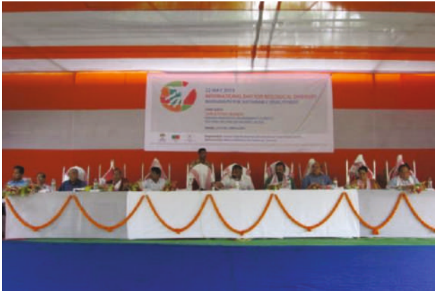
Dignitaries at the Function