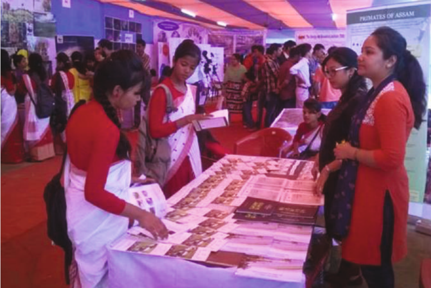
National Science Day Fair, 28 th - 29 th February, 2016