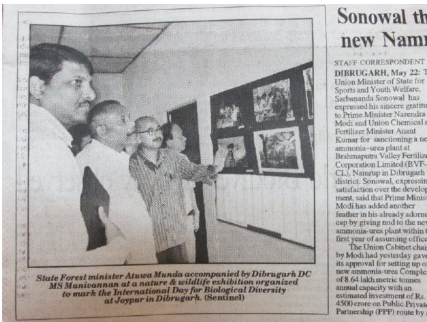
News article about celebration of International Day for Biological Diversity on 22 nd May 2015 at Jeypore RF, Dibrugarh