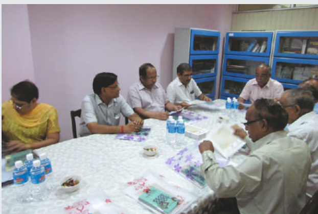
Chairman and members interacting during the meeting