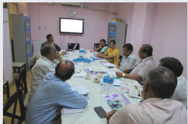
Member Secretary presenting key issues of the Meeting