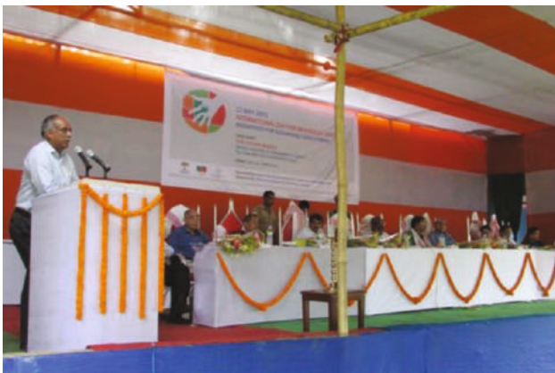
Chairman-ASBB at the Function