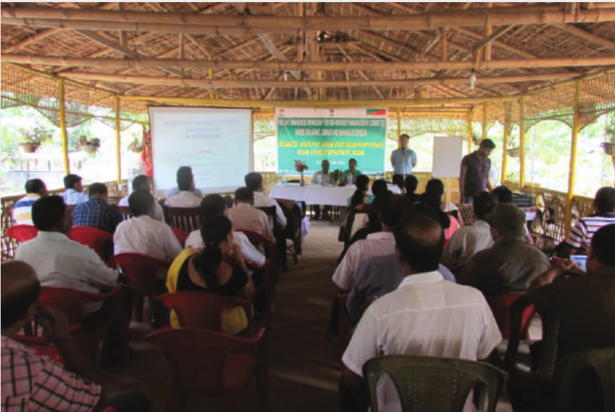
At Golaghat on 13 th May 2015