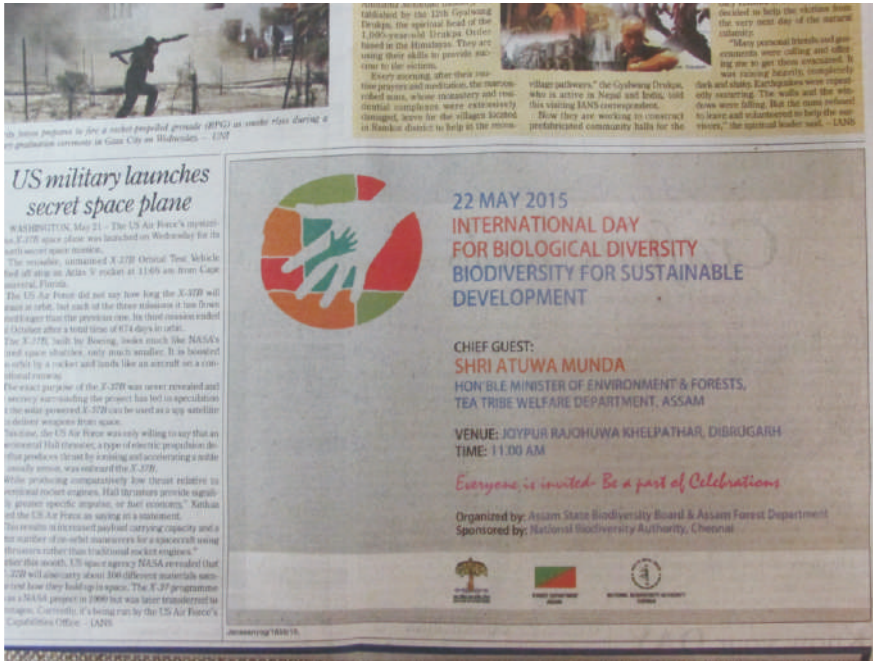
Advertisement for celebration of International Day for Biological Diversity on 22 nd May 2015