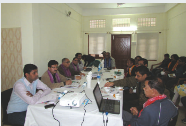
Chairman and Members of the Board along with DFOs & Director of Manas National Park