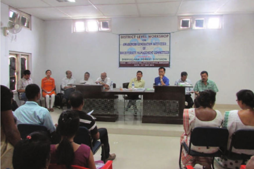
At Dibrugarh on 11 th May 2015