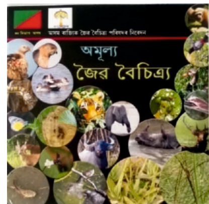
Assamese Documentary on BD Act & Rules

The Board initiated work for declaring biodiversity rich areas of the state as Biodiversity Heritage Sites as per Section- 37 of Biological Diversity Act, 2002. For the year 2015-16, forty proposals were received, of which, around ten proposals are under scrutiny for declaring them as a Biodiversity Heritage Sites.