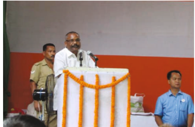
Hon'ble Minister, E & F at the Function