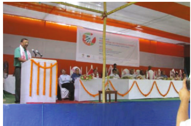
PCCF & HoFF at the Function