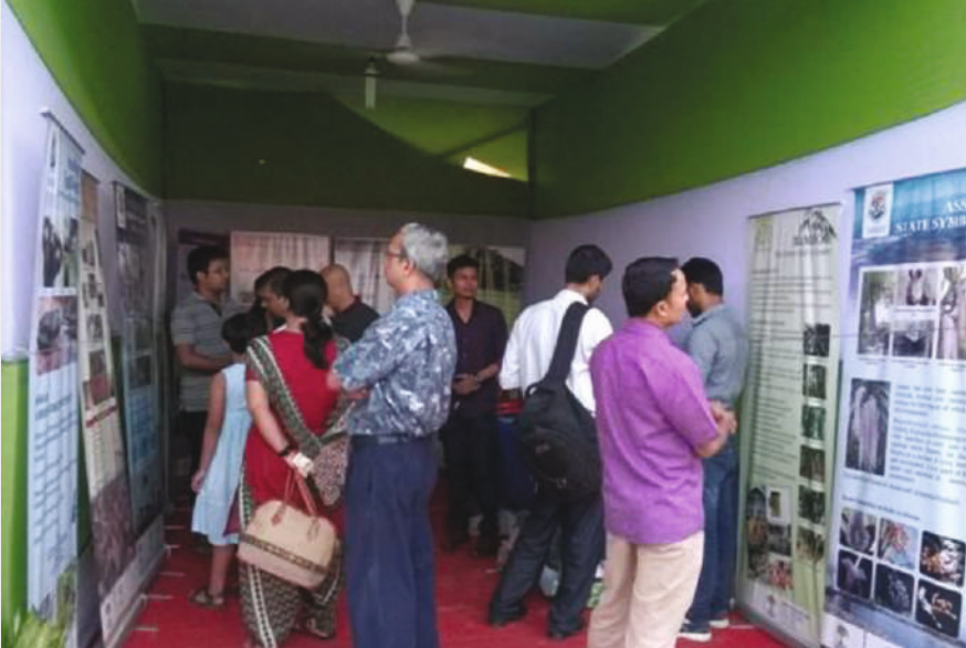
Children's Book Fair, 9 th -18 th October 2015