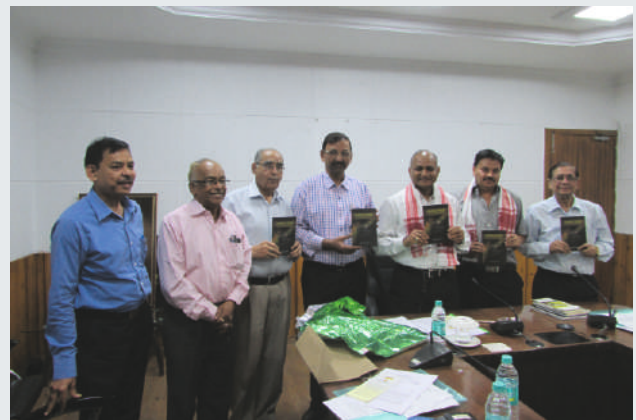
Release of a Book “Common Spiders” published by ASBB during the meeting