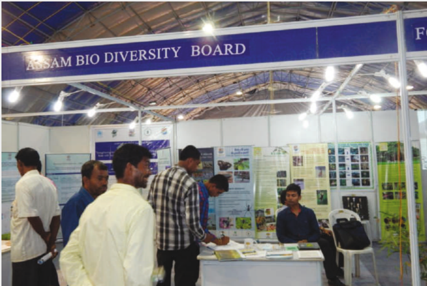
North East Summit, 26 th -27 th May 2015