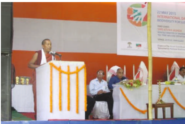
PCCF & HoFF at the Function