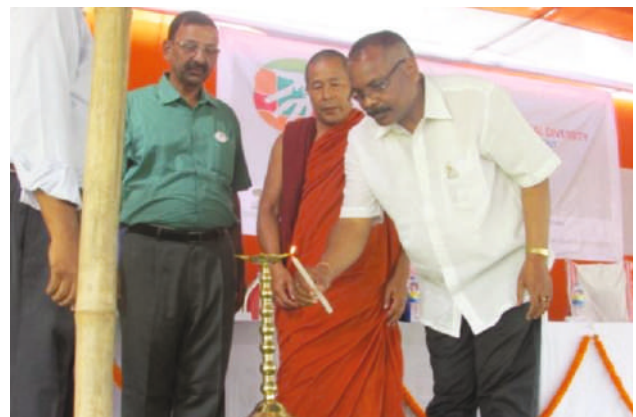
Hon'ble Minister, E & F lighting the inaugural lamp