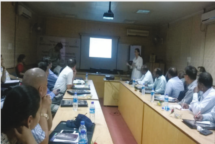
Meeting of NE SBBs at Kolkata, 9 th – 10 th July 2015