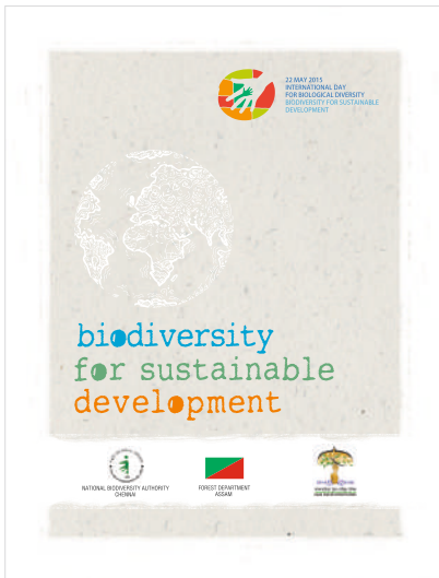
Booklet- Biodiversity for Sustainable Development (English)