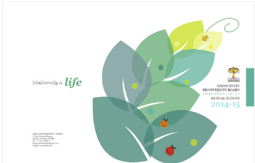
Annual Report 2014-15